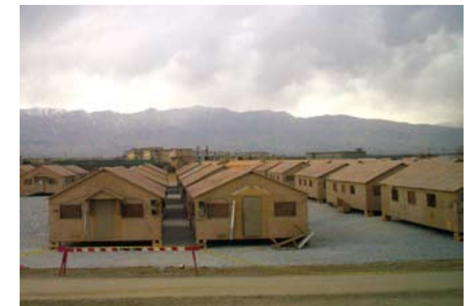
A master plan can provide phased plans to replace initial construction with higher density relocatable buildings. When the threat situation allows, constructing two-story structures further increases density, freeing valuable real estate for other functions.

Since the BCMP serves as the basis for subsequent project programming, development, and execution it is included in the recent pre-deployment training. One of the more recent training initiatives is the USACE-ARCENT Contingency Engineer Management Course (CEMC). Prior to the CEMC, both ARCENT and USACE were aware of a significant training shortfall provided to personnel deploying to the CENTCOM AOR in support of overseas contingency operations. As a result, each agency was developing separate contingency engineering training.